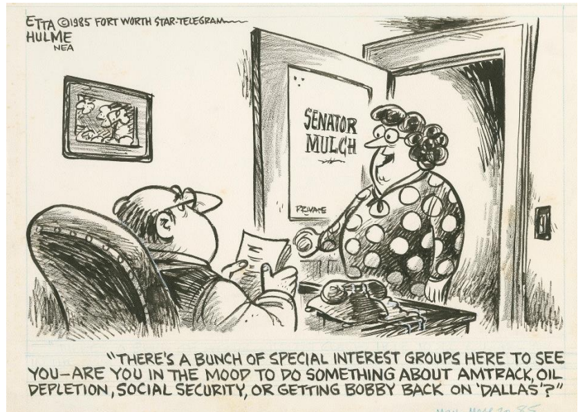
Figure 1: Political cartoon by Etta Hulme. This cartoon appeared in the Fort Worth Star-Telegram, Monday, May 20, 1985